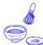
green tea powder